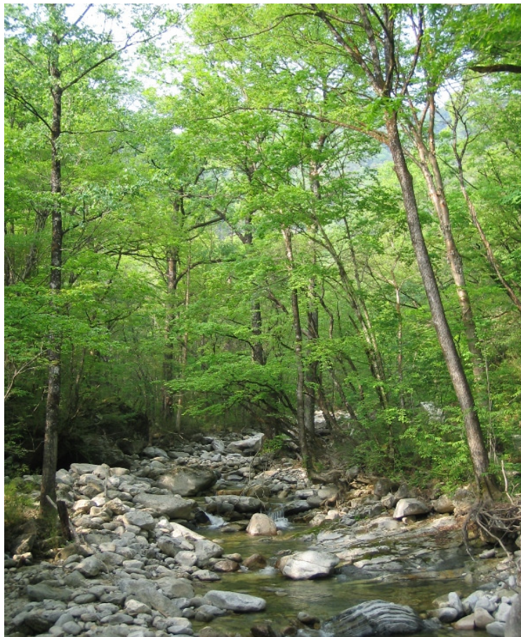
Foping (CN298) is a Giant Panda Ailuropoda melanoleuca reserve in the Qinling mountain range, which protects the temperate forest ecosystem.

IMPORTANCE TO OTHER FAUNA AND FLORA: Giant Panda and Takin found in the reserve.